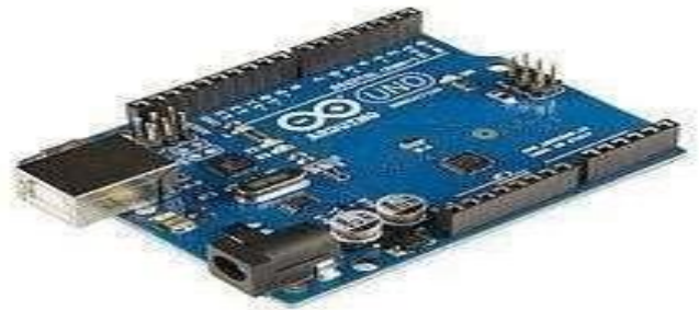
Figure 1.2: Arduino Uno.

PWM outputs, a USB connection, a power jack and a reset button is also present. We are interfacing Wi-Fi module ESP8266 for giving it an internet based approach.