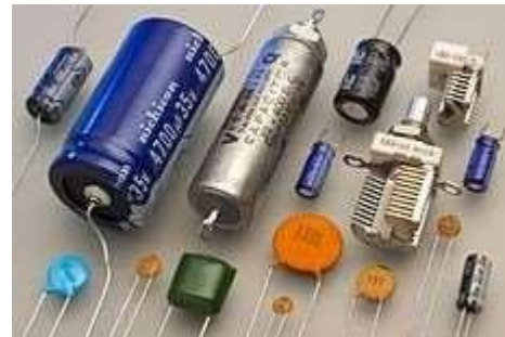
Figure 1.4: Capacitors.

The properties of capacitors in a circuit may determine the resonant frequency and quality factor of a resonant circuit, power dissipation and operating frequency in a digital logic circuit, energy capacity in a high-power system, and many other important aspects.